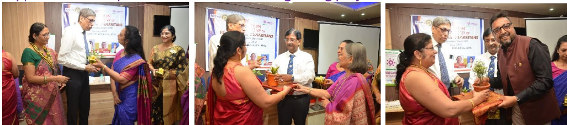
Felicitations of DG, DGE and AG

Felicitation of a few well-wisher Rotarian Friends, without whose continuous and generous support it was not possible for our club to imagine big projects.