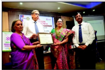
প্রেস ক্লাবে রোটারি ক্লাব অফ ক্যালকাটা ৯ ইনস্টলেশন সেরিমনির আয়োজন করল।