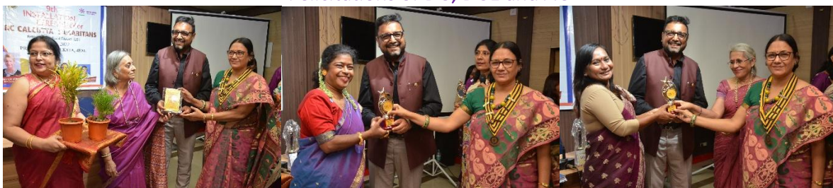
Recognition of club members for their outstanding performance in RY 2021-2022